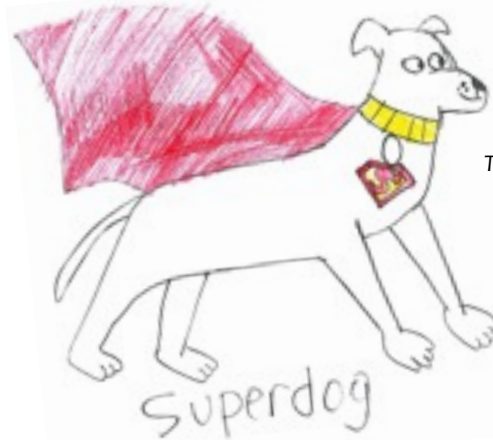
This drawing was delivered to ACN soon after the events described in this story.